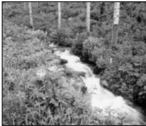
Cover Photo: Mill D North in the Wasatch.