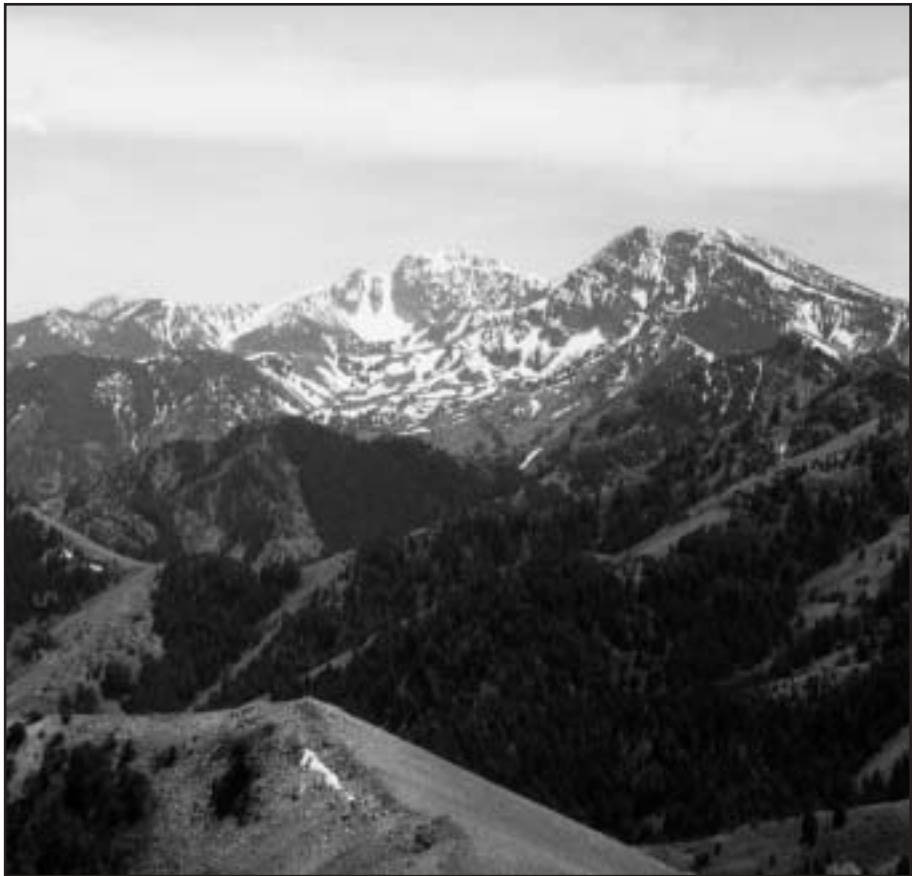
May 21, 2000, View from West Canyon Peak (8382') looking south to Deseret Peak (11,031') Stansbury Mtns.

It might be many years or it might never be possible for us to establish if any particular case of mental retardation or attention-deficit/hyperactivity disorder can be blamed on high levels of mercury. It might still be some years down the road before we can say that the 20% increase in carbon dioxide emissions statewide caused by expansion of IPP contributed to the global warming that finally killed Utah's skiing industry. But it behooves Utah's leaders to begin thinking about the how much coal really costs us now. ☹