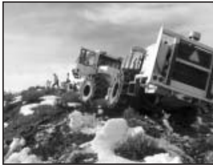
Thumper trucks

In February 2002 (when work on the project was 50% complete but it had not yet entered proposed wilderness areas), the aforementioned environmental groups won a temporary stay of the BLM's decision, stopping the thumper trucks in their paths. A divided panel of the Interior Board of Land Appeals upheld BLM's decision in late August 2002, meaning work could proceed. After learning that the seismic contractor