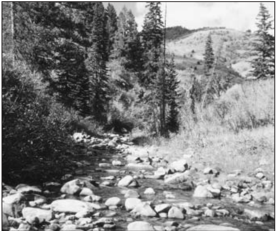
Oct 13, 2001, Saturday Middle Fork Ogden River four miles from trail head lookin up stream.