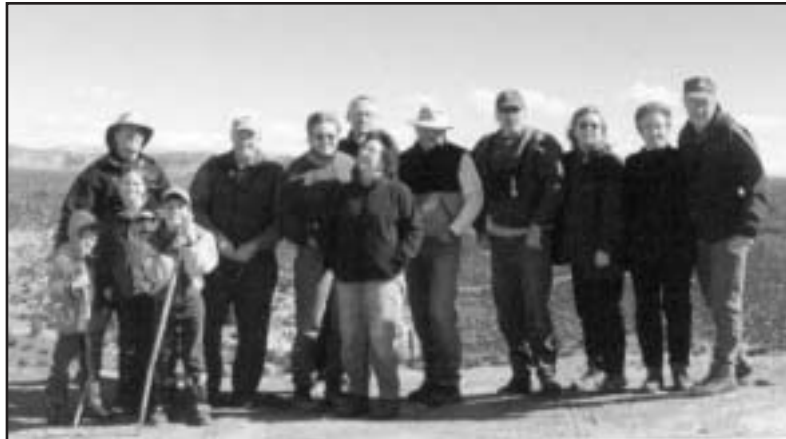
Capitol Reef Hikers

Following dinner, the group took a short journey up the Hells' Backbone road Northwest of town to the Boulder