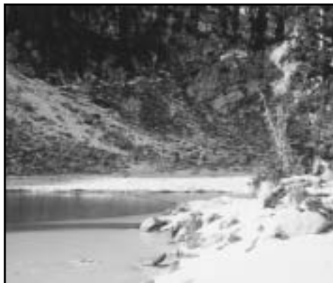
Cover Photo: November 4, 2001, Sunday at Silver Glance Lake. 10,000 feet, 3 p.m. and 58°.