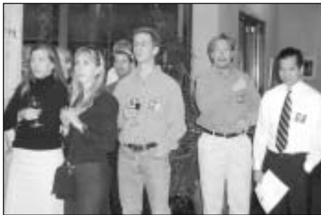
The bidding was intense for many items at the Annual Fundraising Social and Auction

Our Fall Fundraiser and Social raised a record amount for the Sierra Club Political Committee this year. We couldn't have done it without the generous support of our sponsors, Oasis Café and Uinta Brewing Company, and our donors listed below. The evening was an enjoyable and informal atmosphere to socialize and hear from some of the candidates endorsed by the political committee. We had some of our best auction items ever at this year's event—a fact one can see from the tension in the faces of the guests in the accompanying photo. Thanks are also due to the volunteers, guests and candidates who made this wonderful night possible!